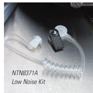
NTN8371A Low Noise Kit