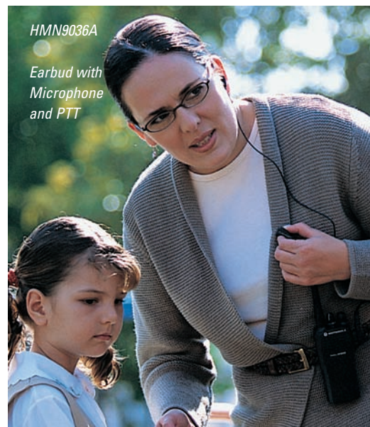
HMN9036A Earbud with Microphone and PTT