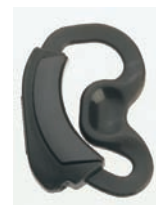
Earholder for Ear Microphone System