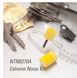
NTN8370A Extreme Noise Kit